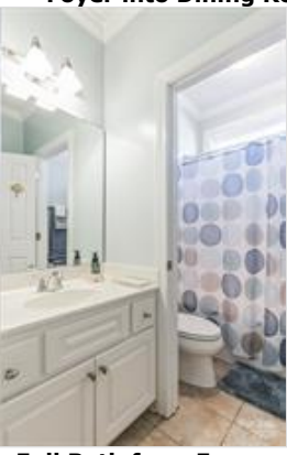
Full Bath from Foyer