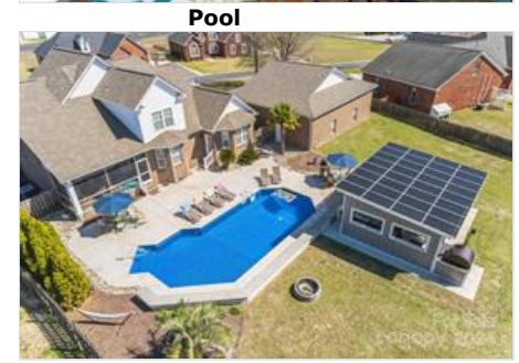
Aerial Pizza Oven w/solar panels