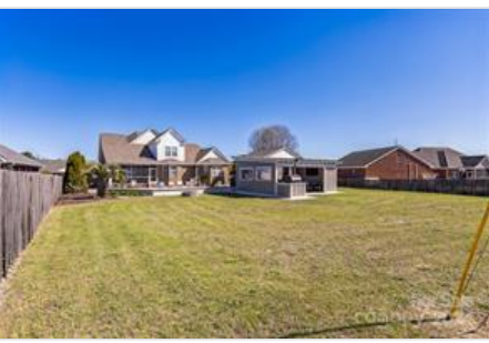
Back Yard w/Outdoor Kitchen