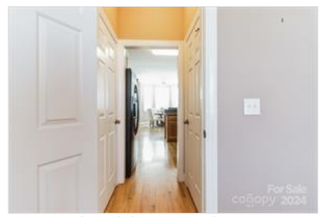
Pantry door (L) Storage door (R) between Dining & Kitchen