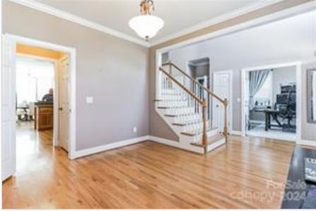
Dining into Foyer