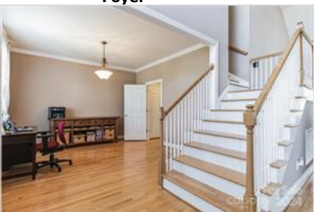
Foyer into Dining Room