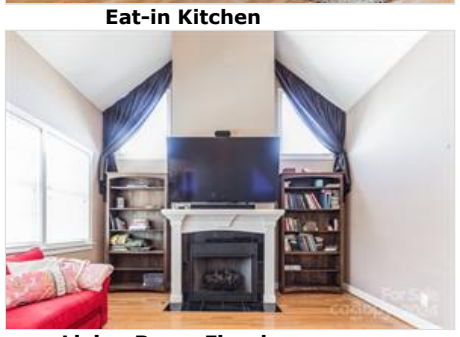
Living Room Fireplace