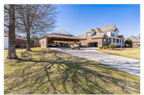
Front Yard w/Hangar