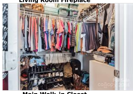
Main Walk-in Closet